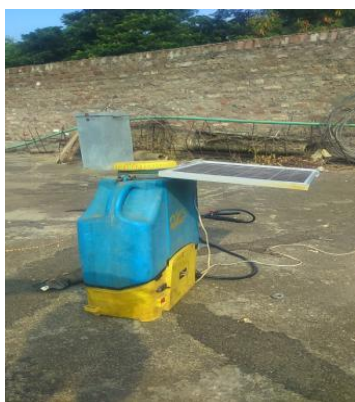
Fig.-4: Final solar spray pump Detail cost chart:

Fig.4. shows photos of lab built solar operated spray pump with facility of mobile charger and LED bulb. The solar panel is attached to spray pump in such a way that, it come exactly on the head of farmer, while spraying pesticides and it will protect the famer from direct sun rays heating. Based on experiments, it is found that charged solar pump sprays can used during day time between 9 AM to 5 PM. All the tests are successfully carried out at same time. Fully charged solar spray pump works for 7-8 hrs. Continuously and same time it will be charged. We also use both portable devices (LED and DC mobile charger) during working hours. Hence this modern model is more effective than any other spray pump. The model cost is Rs 3130/- and it is affordable for common farmer.