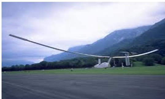
Air Human Powered Vehicle

Airplanes are one of the most interesting areas of HPV. They are not many of them HPV-Aircraft Daedalus 88, remained almost 4hours in air A human powered helicopter is one of the largest and delicate Human Powered Vehicle.