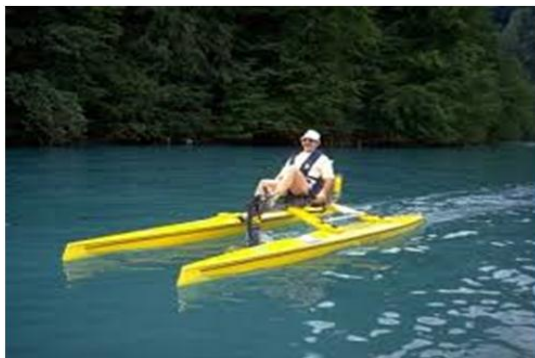
Water Human Powered Vehicle

Most of the water HPV are used in leisure area. They are driven by canoeing, rowing and blade wheels or propellers. But in Human Powered Water competition, very fast boats are used driven by propeller or air screws. Some boats use hydrofoils to minimize the water resistance for more speed. Also, submarine is a type of human powered water vehicles. Today human powered submarine is free flooding wet submarine.