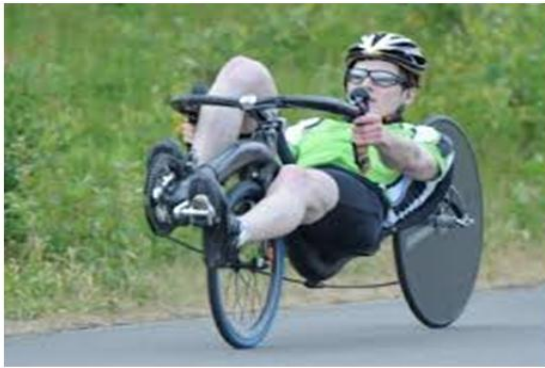
Land Human Powered Vehicles